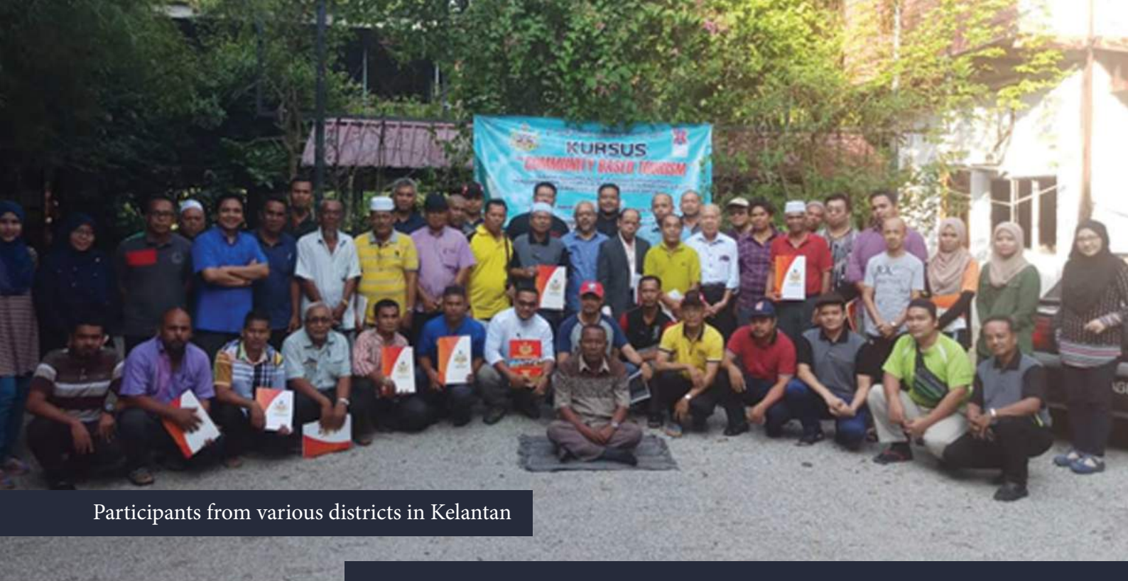
Participants from various districts in Kelantan

Community-based tourism or CBT is a form of tourism that emphasizes the involvement of the host community in planning and maintaining tourism development in order to create a more sustainable industry. The CBT concept is not new and has been introduced since the mid-90s to promote community participation in the tourism industry. CBT has been identified as a viable tool to support socio-economic development and poverty reduction. In theory, CBT can provide significant economic benefits to the local community as an income supplement through many tourism activities such as homestay, selling local handicrafts and guiding fees. CBT ventures are managed by a community comprising various enterprises and businesses owned and operated by community with the goals of providing economic benefits to the community. Through CBT ventures, there will be active participation by the community in tourism planning, promotion of host-guest interactions, and preservation of cultural and natural heritage.