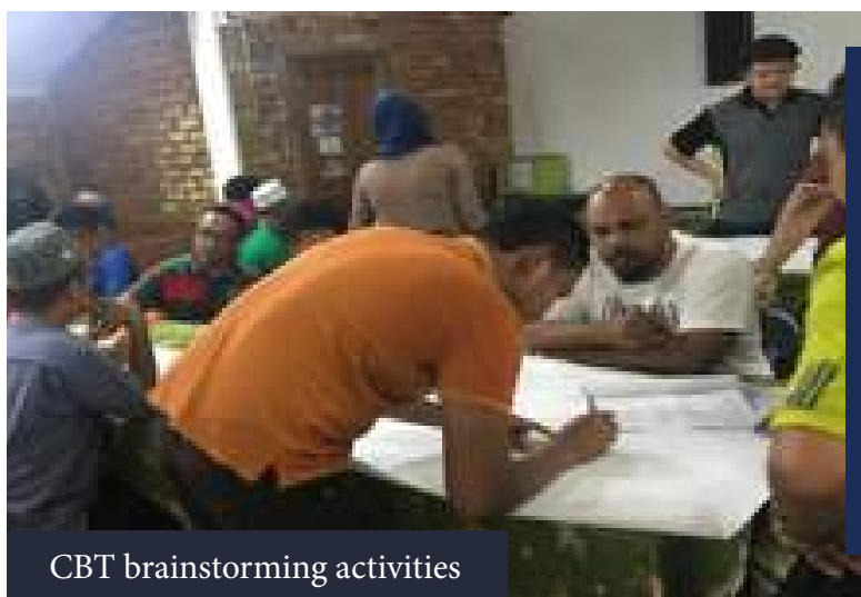
CBT brainstorming activities

MHC has earned several recognitions and standards such as ASEAN Green Hotel Standard 2018-2020, ASEAN CBT Standard 2019-2021 as well as recognitions from global travel companies such as TripAdvisor and Booking.com. The HRD appointed six members from the Faculty of Hospitality, Tourism and Wellness, Universiti Malaysia Kelantan (UMK) as CBT project consultants to assist the state government in developing CBT for identified districts in Kelantan. The appointed members are tourism experts and experienced in research and consultation projects. There were three main objectives of this CBT workshop. First, to give exposure to the participants about CBT and the tourism industry in general. Second, to create awareness among kampung community management about the importance of CBT in creating new jobs and providing additional incomes to the local people.