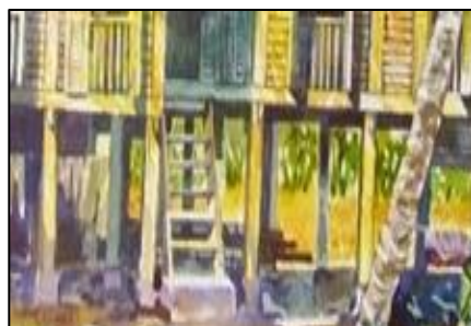
Figure 3: Examples of design principles (Balance)

It shows that the work has an assimilation balance