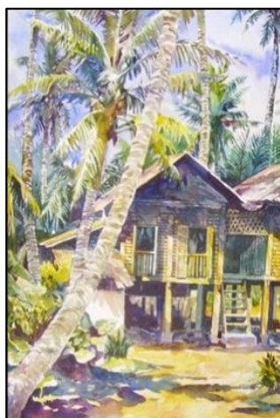
Left side of the work