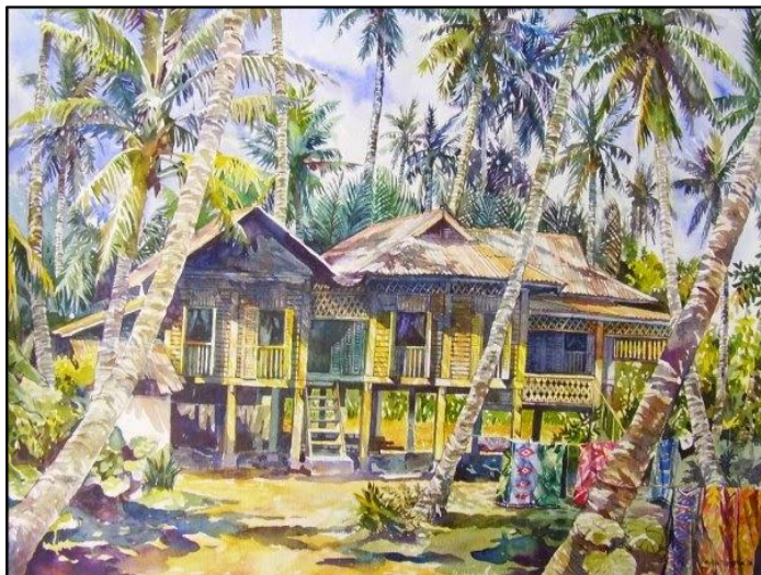
Figure 2: Haron Mokhtar “Suasana di Kampung” (2007) water colour, 640 cm x 450 cm, Realism