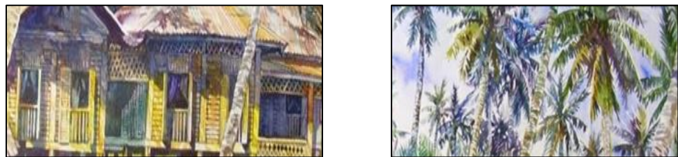
Figure 5: Examples of elements of Art (Colour)