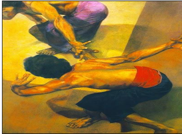
Figure 1 Pahlawan2 (1980)

Amron Omar, "Pahlawan 2" : (1980), Oil paint on canvas