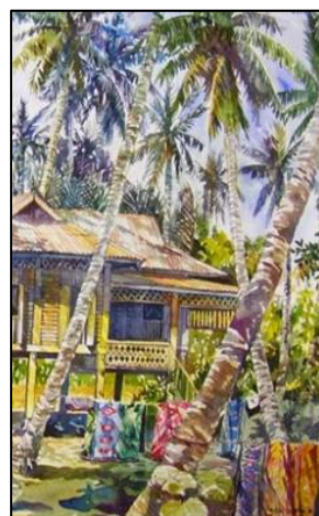
Right side of the work

It shows that the work has an assimilation balance