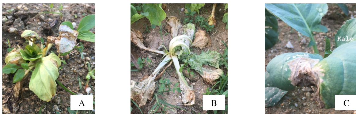
Figure 1. Infected leafy vegetables. A) Green Pak Choy that suffered from stunted growth and downy, B) Collapsed Curly Wrap Wong King with wilted and papery leaves and C) Brown leaf spot present in the edge of Chinese kale leaves.

The soil samples were originated from green leafy vegetables cultivation of Green Pak Choy (Soil 1), Curly Wrap Wong King Pak Choy (Soil 2) and Chinese Kale (Soil 3). These green leafy vegetables were observed to have fungal disease as in Figure 1. The soil samples were freshly collected after morning watering took place and left for slow air dry under warm temperature for 14 days to imitate natural physiological drying process and reduced excess moisture. Desiccation diminished bacterial growth in soil samples but fungal growth remained constant [11, 12]. The drought resistance of fungal was mainly attributed to the presence of thick cell wall [13]. The strength and integrity of this chitin composed structure can be enhanced through the incorporation of \beta 1, 3-glucan carbohydrate which cross linked with chitin [14].