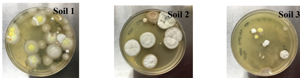
Figure 2. Fungi on 10^{-1} serially diluted soil suspensions isolation plates.