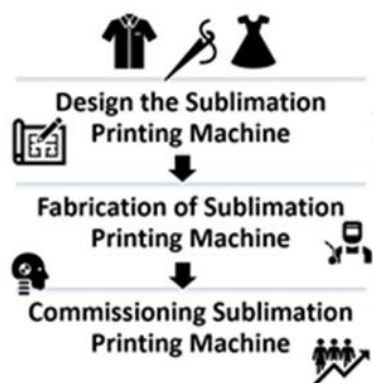
Figure 2. Flow process of fabrication of sublimation printing machine

After accomplishing the installation process, the mechanical part was embedded with the automatic processor micro system to control printer speed as required. The last section of the manufactured were field testing in industry and product commissioning. Indeed, the field tests purposely to update the settings of parameters and components in the printer speed control system to ensure the efficiency of the printer machine runs smoothly. While test acceptance of printing machines the training to staff in the company also being provided.