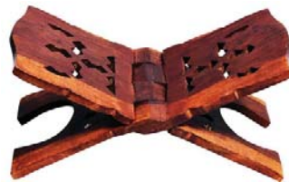
FIGURE 1. Rehal or book rest [2].

Rehal or also known as Rihal, is a book rest shape like an X, which is designed to place holy books during recitation. According to Hughes, Rehal is designed to look like a piece of the board when it is closed, and it looks like the letter X when it is used [1]. Figure 1 shows the existing Rehal in the market. Muslims usually use this small furniture as a base for reading Quran and religious books. It is often used during religious classes and ceremonies.