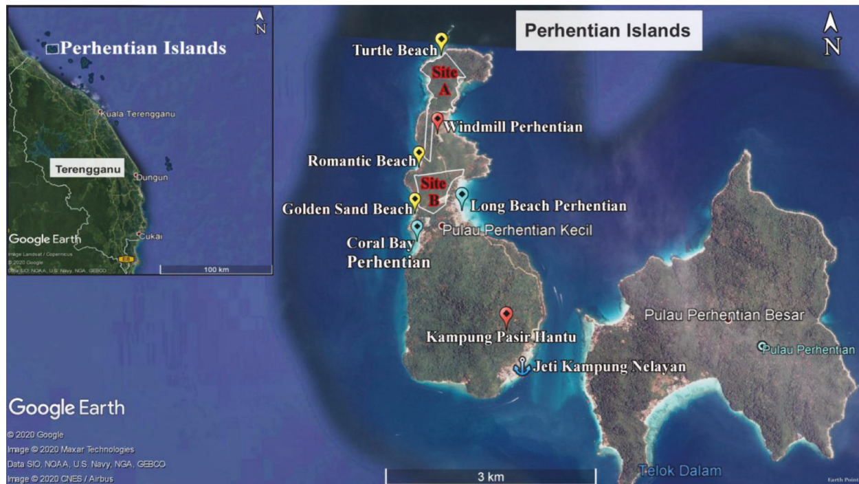
Figure 1. The location of Perhentian Islands (Pulau Perhentian Kecil & Pulau Perhentian Besar) in Terengganu (inset) and location of sampling sites in Pulau Perhentian Kecil: Site A and Site B.

rotten baits. Opportunistic sightings of small mammals in the sampling sites during netting and trapping were also made whenever possible. The total netting and trapping effort in this study summarized in Table 1. All standard body measurements (vernier caliper & metal ruler), weight (spring balance), gender and maturity state of each captured mammal taken for record and identification purposes based on the identification keys in species identification books (Francis 2008; Kingston et al. 2009). Selected individuals were euthanized and collected as voucher specimens by ethanol preservation (Permit number D-01052-16-19). These were deposited at Faculty of Earth Science, Universiti Malaysia Kelantan. Results are presented in the form of species composition at both sites with assessments of the most recent conservation status of these mammals (IUCN 2020; https://www.iucnredlist.org/ ) and Red List of Mammals for Peninsular Malaysia Version 2.0 (Perhilitan 2017). Lastly, we compared the results of this study with past studies in the Perhentian Islands (Kecil and Besar) plus other Malaysian east-coast islands including Pulau Bidong, Pulau Redang, Pulau Tenggol, and Pulau Tioman.