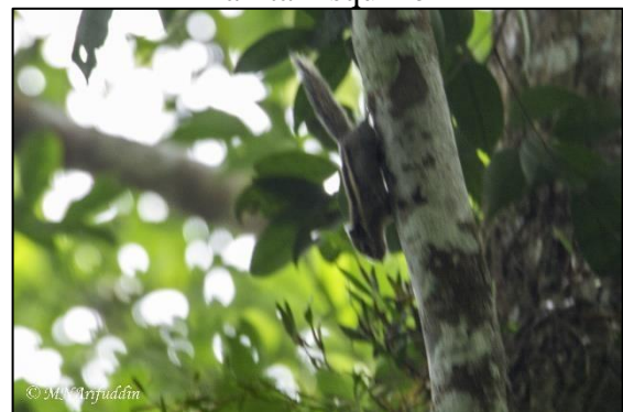
Himalayan striped squirrel