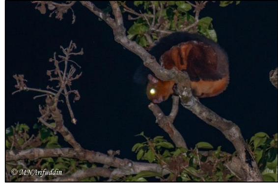
Spotted Giant gliding squirrel