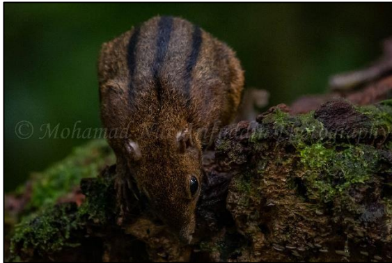
Three-striped ground squirrel