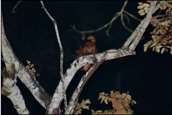
Red Giant gliding squirrel