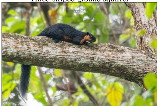
Black giant squirrel