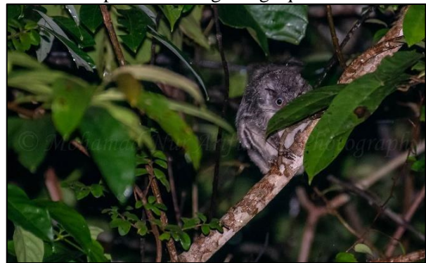
Temminck's gliding squirrel