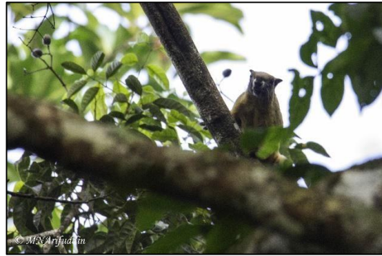
Cream-coloured giant squirrel