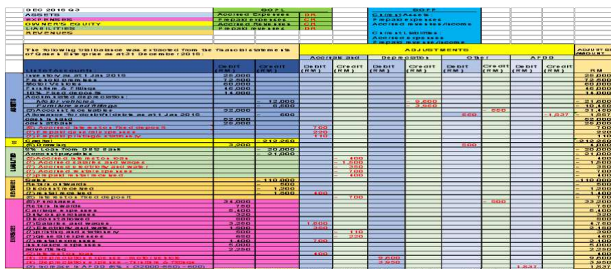
Figure 1: The frontpage of FS Template Made Easy

"FS Made Easy Template" has been produced to help students understand this topic easily and in turn be able to score high marks for this topic in the final tests and exams. This approach would enhance student's understanding on the double entry rules whereby they use Microsoft Excel to do the final year adjustments in a specific column of debit and credit before preparing financial statements. This would reduce the tendency of missing items in the financial statement as compared to traditional approach by focusing on the format of financial statements. FS Made Easy Template was shown below: