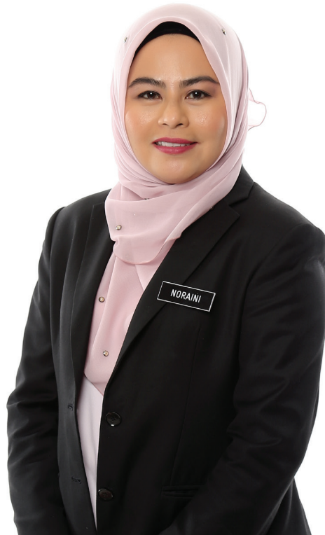
YB Datuk Seri Dr. Noraini Ahmad Minister of Higher Education

T he higher education sector is diligently obeying and implementing the new norms brought upon by the COVID-19 pandemic. Efforts in keeping up with the Fourth Industrial Revolution has been accelerated to ensure the quality of higher education continues to improve despite the current challenges faced.