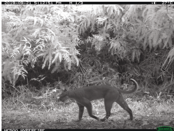
Image 1. Asiatic Golden Cat Catopuma temminckii recorded in unprotected State Land Forest, Pahang, Peninsular Malaysia on 21 September 2019.

Malayan Tapir and Red Jungle Fowl Gallus gallus .