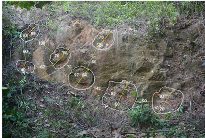
Figure 4. Distribution and distances (cm) of tracks on trackways.