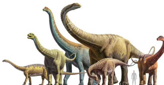
Figure 5. Sauropod.

Based on tracks site these fossils represent an animal within the size range of large cretaceous sauropods reaching a length of 22 meter long and 9 meters high, with weight estimated 30 to 40 metric tons [6].