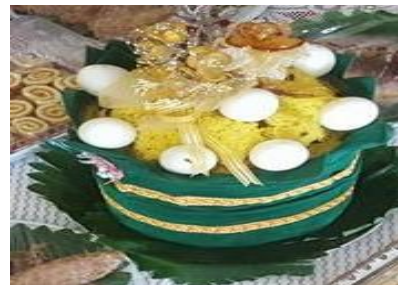
Figure 4: Sessok