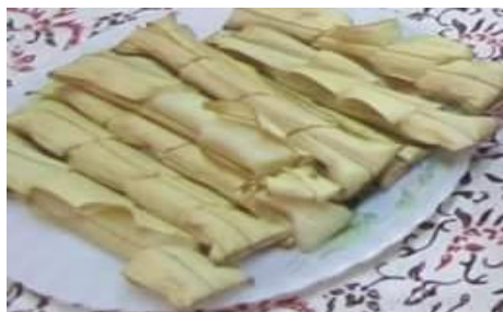
Figure 3: Leppe-leppe