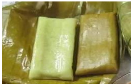
Figure 1: Burasak

Indirectly, their traditional food is a recognition of the community to the outside world. Bugis traditional foods that are commonly found in Johor are burasak, lepat loi, barongko, bejabuk (serunding) and nasu mettih (asam pedas ikan parang). The food is a must for the Muslim Bugis people during their gatherings. Based on the above notions, various thoughts and opinions related to traditional foods can be evaluated (Fitrisia et al., 2018).