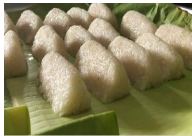
Figure 2: Lepat loi