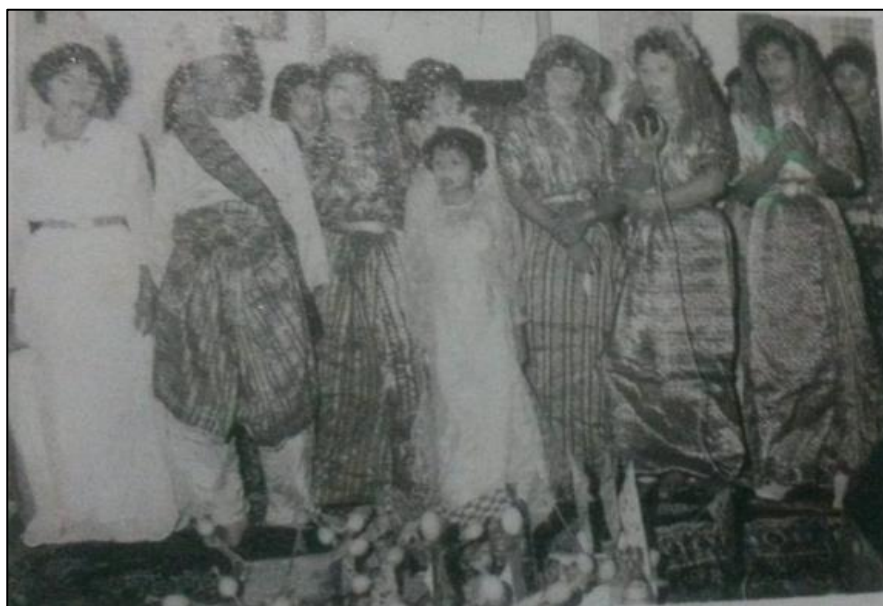
Picture 4.31: The Sarawak Malay community in the Al-Quran khatam ceremony in 1950 wearing a head covering with a shawl and Selayah kelingkan and wearing a sarong jong on page 11 of the book titled Study of Traditional Malay Textiles

Source: the book of Malay woven textiles The Beauty of Traditional Nusantara Culture by Ismail (1990).