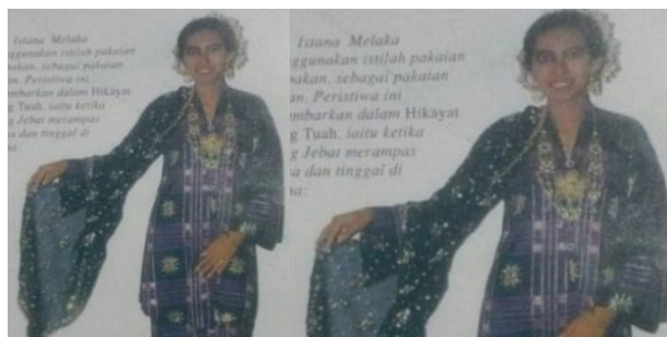
Picture 4.29: This illustration of a Malay woman wearing a long kebaya and sarong songket was taken from a book in the Pahang State Museum board's official photo. The photograph of this woman can be seen on page 65 of Siti Zainon Ismail's book, "Malay Woven Textiles: The Beauty of Traditional Nusantara Culture" (1994)

Sarawak Textile Museum, there is information that states that most of the motifs found in the art of kelingkan embroidery are borrowed from textiles that have been woven or printed. The finishing of the side of the scarf or selayah also has a finishing with needle lace or better known now as the bamboo shoots. In the past, baju kurung and baju kebaya were also made with the needle lace motif. Nowadays, the majority of Malay people choose to wear scarves and selayah kelingkan.