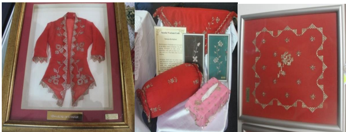
Picture 4.34: Souvenir items such as home wall decorations, tissue containers and small decorative pillows