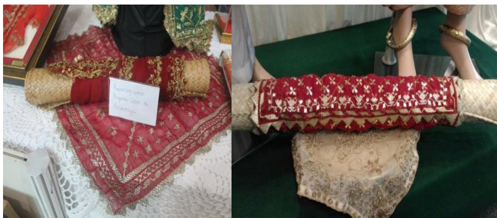
Picture 4.37: Pictures of the groom's "cab" for the wedding ceremony