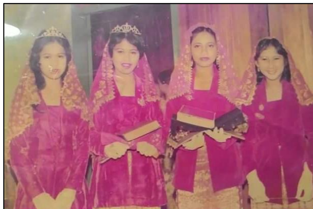
Picture 4.32: Women in the olden days wearing selayah kelingkan at the Al-Quran khatam ceremony

Source: the book of Malay woven textiles The Beauty of Traditional Nusantara Culture by Ismail (1990).