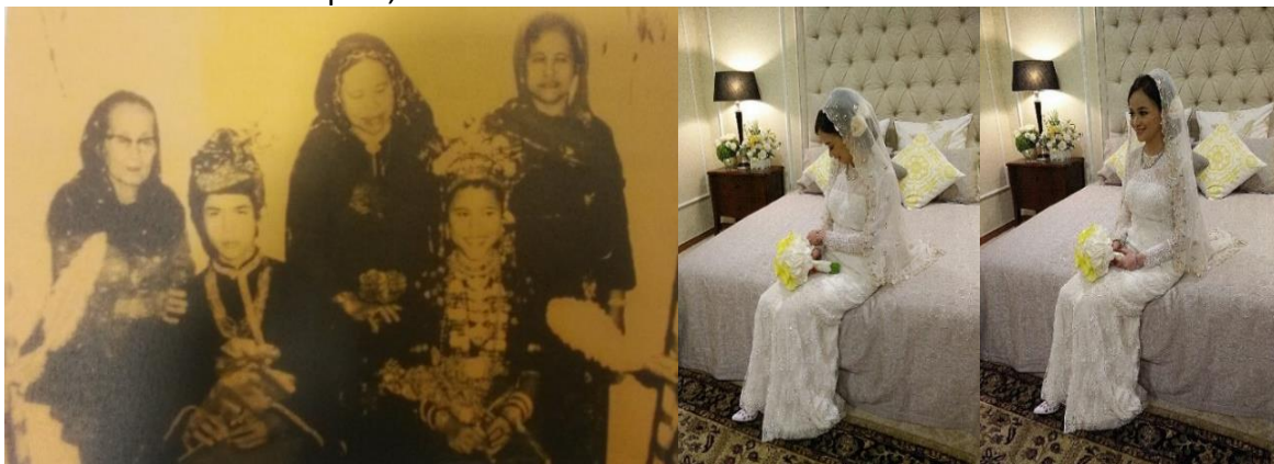
Picture 4.36: Wedding photos that Malay women wearing kelingkan in the past and now. Kelingkan is worn by the bride and the guests attending the wedding ceremony

Carrying the bride and groom to the marriage ceremony, is a social duty based on custom, particularly in the Malay community of Sarawak. A "cab" on which the groom is carried to the wedding ceremony serves as a "door opener". The groom should provide the bride her "cab". A fight or a martial arts fight will take place here to capture the bearer, and the man must defend and hand it over to the woman, and the wedding will then continue with the ceremony of eating "nasi temuan". According to an official at the Malaysian Handicrafts Development Corporation, Sarawak Branch, one of the unique aspects of kelingkan embroidery art in Sarawak is the nasi temuan ceremony found at Sarawakian Malay weddings, which is passed down from generation to generation. This ceremony is only performed by wealthy people who performed the "makan bersuap" known as adat. In olden days, it was believed that if the woman "feeds" first in the rice-eating ceremony, the man would be controlled by his wife, and if the man "feeds" first, the man would become the head of the family. This was the belief of our forefathers in the past, but there is no such belief in Islam.