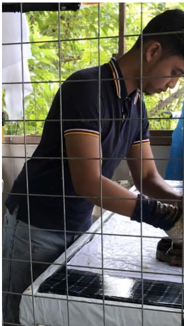
Figure 1 - Current working posture for batik stamping

From a simple observation and interview, it is shown that the subject clearly experiencing posture discomfort during work. The existing working posture involved awkward posture in repetitive motion while handling copper block with their hand. A RULA assessment was done on the current working posture to determine its working risk factors. The working posture assessed is shown in Figure 1.