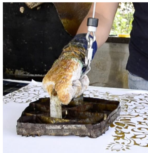
Figure 3 - Copper block handle attached to the crane system

This crane system was designed and assembled inside the batik stamping workshop. A hoist device from the crane is able to move in all 3-axis direction inside the workshop. This hoist will be attached to the copper block handle with the help of hook and spring balancer to eliminate the load handled by the worker while stamping process was done. The usage of spring balancer is to provide an ease lifting force when the copper block is ready to be dipped into the hot molten wax pan. Figure 3 and 4 shows the batik stamping work after engineering approach intervention that had been done.