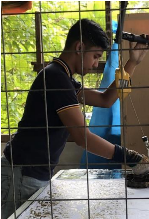
Figure 4 - Batik stamping work after engineering approach