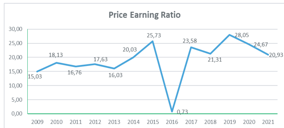
Figure 2: Price Earnings Ratio (PER).

a decrease in book value per share because one of the cement companies had a low equity book value. Low equity is caused by, first; the company suffers a loss, second; there is an element of equity change that increases the retained earnings that have not been determined (retained earnings unappropriated). Retained earnings reflects that the company has fund which is ready to be used for business activities, or commonly known as reserve fund. However, if the balance of undetermined profit is higher than the profit that has been determined, the company cannot use undetermined equity to generate optimal profits. This condition provides information (as bad news) for investors which will impact on their investment decisions. In the event of a lack of purchase of the shares, it will not increase the value the price of shares in market. Until 2021, PBV experienced a decrease due to the high allocation of retained earnings unappropriated. Retained earnings, in which the use are not determined yet, is usually distributed to shareholders as dividends. The retained earning that has been determined to be used will be low so