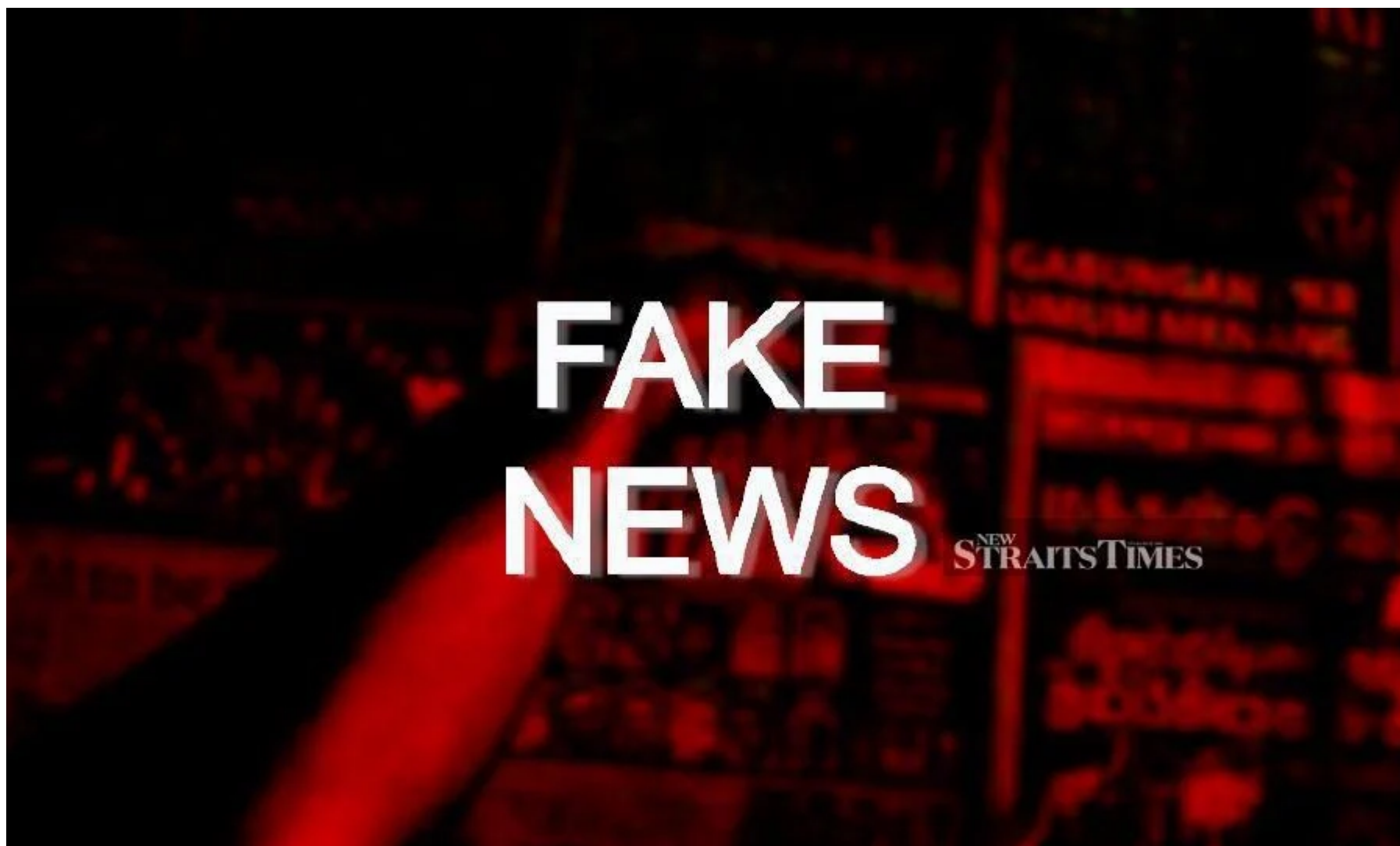
Fake news is bad, but fake medical news has a serious debilitating effect on the nation.

LETTERS: The Internet has enabled a whole new way to publish, share and disseminate information, but with little regulation or editorial standards.