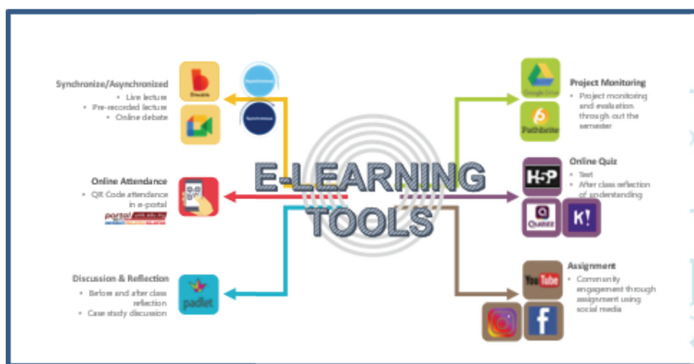
Figure 1: Utilizing e-campus platform for Teaching and Learning activities.

In ESD course the students need to share and engage the knowledge that they have learnt with community. Therefore, community engagement via physical approach and using social media has given a new way for the students to share their knowledge with the community not only around their family and friends but to all over the world. Figure 1 shows the integrated and interactive approach tools that have been used in teaching and learning for ESD course.