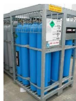
Figure A.1b. Cylinder baskets