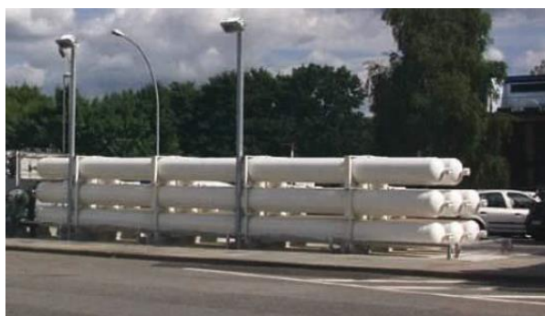
Figure A.1a. Fixed cylinder bundle

Hydrogen is also classed in Schedule 2 under Group 3 (Highly Reactive Substances) with a threshold quantity of 10 tonnes. Oxygen is classed under the same group but with a threshold quantity of 500 tonnes. The threshold quantity of other flammable substances at site (if any) is 200 tonnes as defined in Schedule 1 (3c).