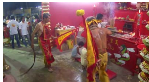
Fig. 5: The spirit medium is using the whip

they come to the temple with the intention to change their current situation. There is a crossing from a profane to a sacral world in the sense by Eliade (1998). According to him, the architecture itself can symbolize a crossing from the profane to the sacral world (Eliade, 1998). The people who want to get rid of their bad luck and to purify themselves enter the temple which can be considered as sacral as this is the place to communicate with the Gods. However, during the festival of the Nine Emperor Gods, the area around the bridge forms a kind of semi-circle. Only the people who want to change and to purify themselves and their current situation enter this area. The committee members wear white clothes and fast during the whole festival. This symbolizes also that there is a sacral situation.