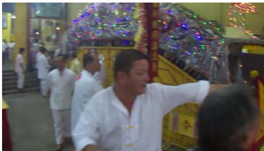
Fig. 2: The bridge that will be crossed during the festival