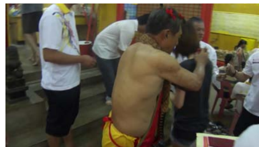
Fig. 4: The drums that are used during the bridge crossing ceremony